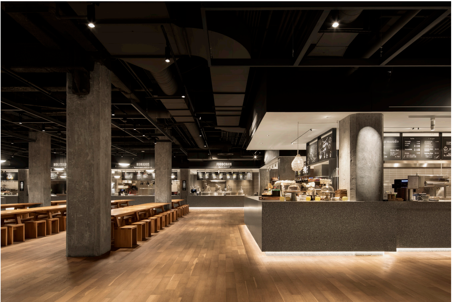
TIME OUT MARKET Montreal, Canada

Selected clients include: Agence NC, Maison Christian Dior, La Fondation pour l'Art Cartier, Google, IN Studio, GH+A Design, Ivanhoe Cambridge, Fairmont Hotels, HOK architects, NORR architects, GSMRJCT, Perkins + Will, HUMA design, Diamond and Schmitt Architects, Figure3, Sid Lee Architecture, Dialog Architect, Partisans, Aedifica, Cirque du Soleil, MSDL Architects, Provencher Roy, IBI Group, Lemay Michaud Architects and Scenoplus.