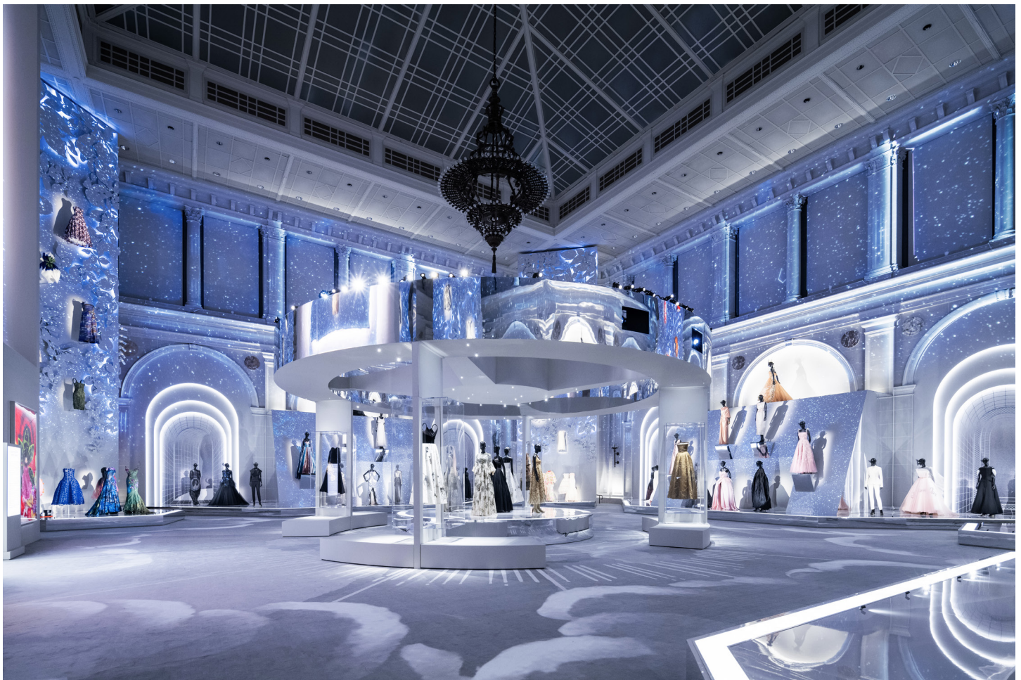
CHRISTIAN DIOR DESIGNER OF DREAMSTRAVELING EXHIBITS Doha, Brooklyn, Chengdu, Shanghai