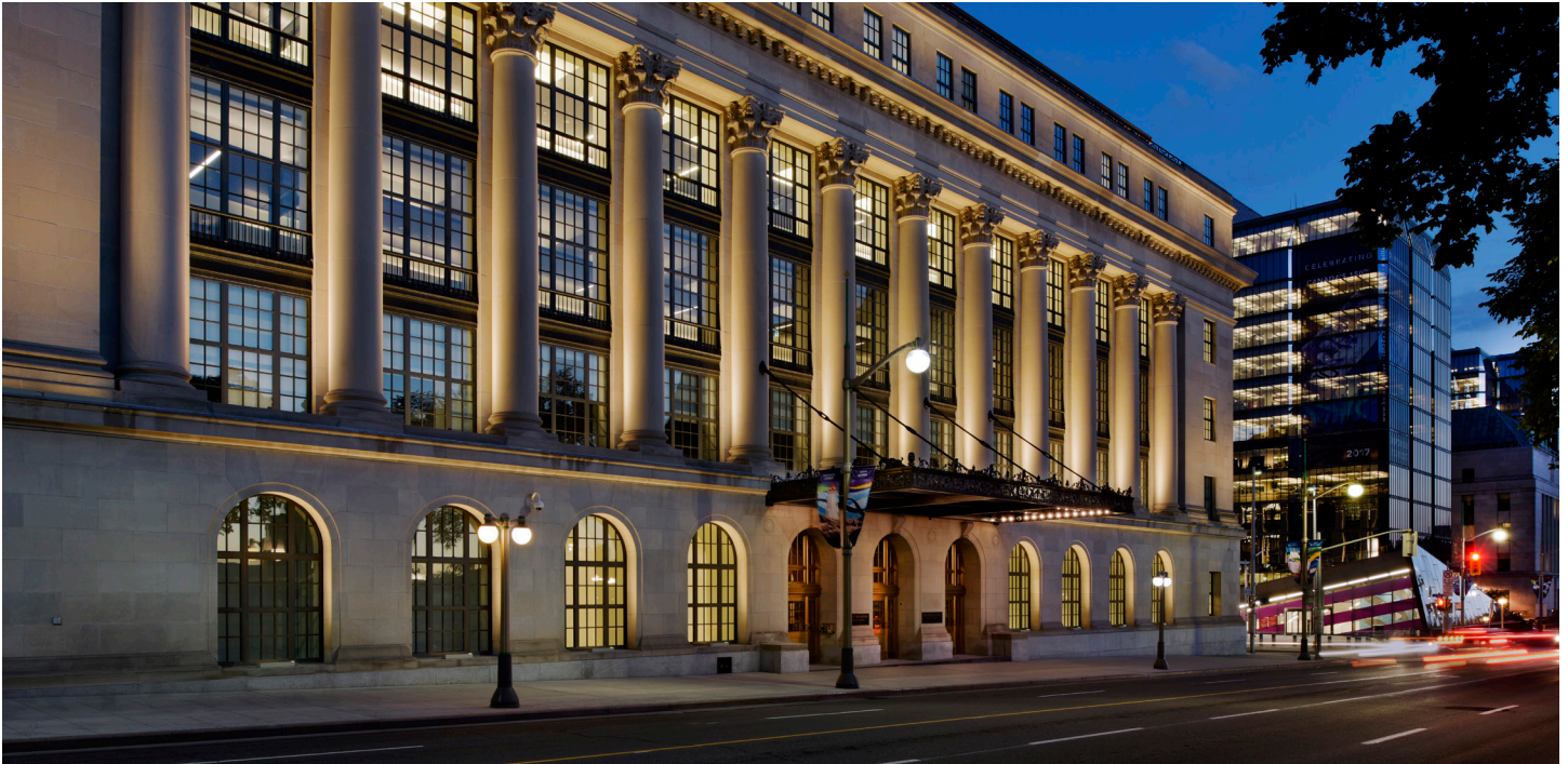
180 WELLINGTON BUILDING Ottawa, Canada