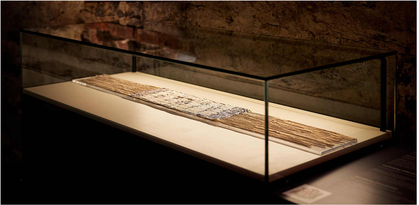
POINTE-À-CALLIÈRE MUSEUM Montreal, Canada | Exhibit Designer - GSM Project