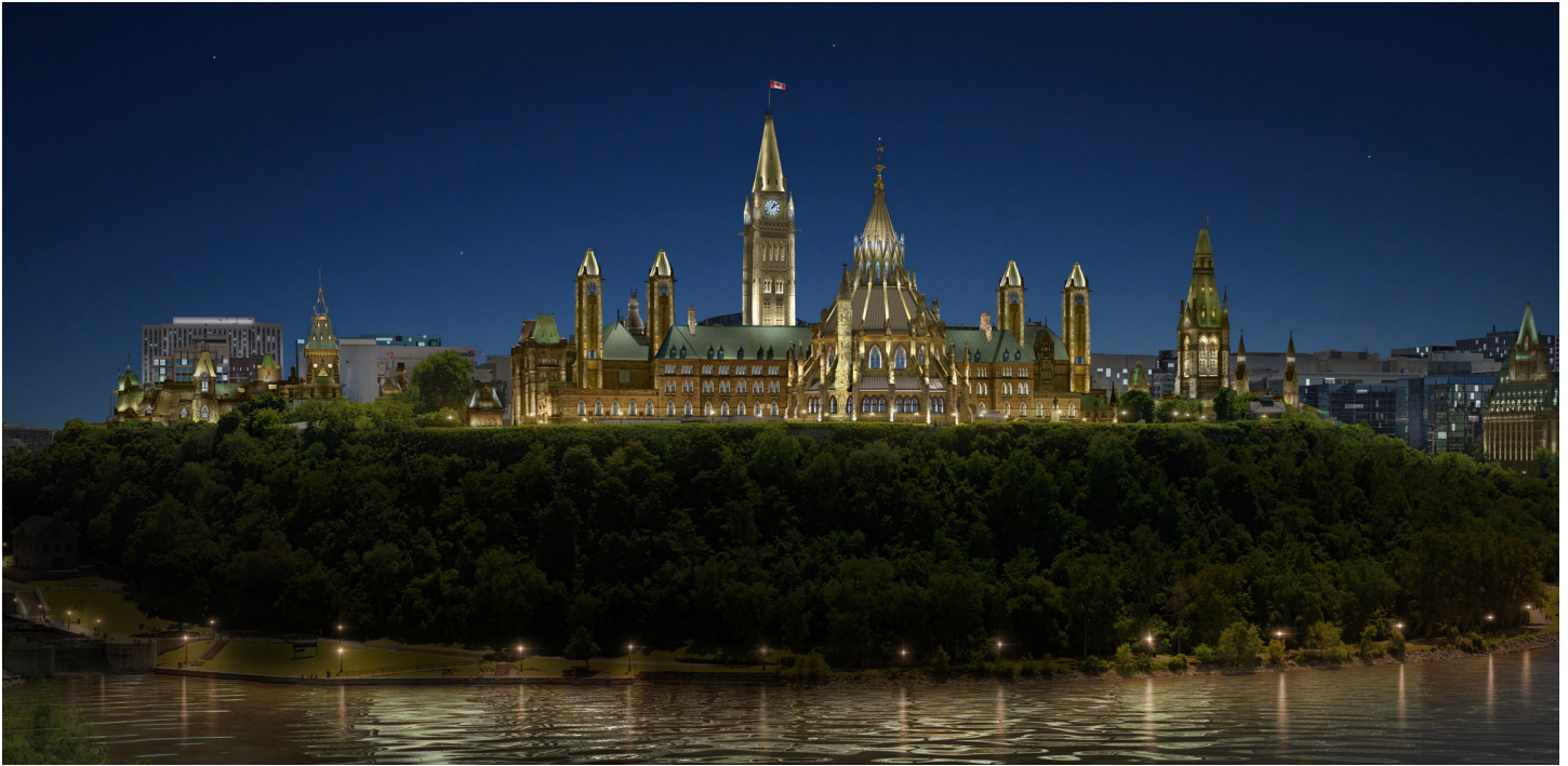
PARLIAMENT HILL PRECINCT MASTER PLAN Ottawa, Canada